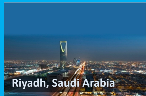
Riyadh, Saudi Arabia